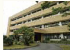
A University Head Office Bldg.