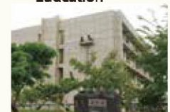
H Faculty of Agriculture