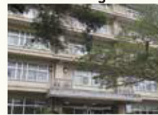
C General Education Center (Institute for Global Education)