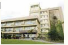
D Faculty of Humanities and Social Sciences