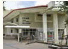
B University Hall (Career Education Center & Entrance-Exam Dept.)