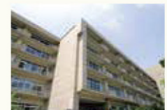
E Faculty of Education