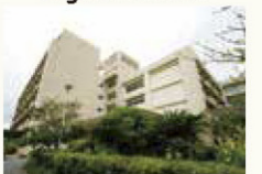
D Faculty of Global and Regional Studies