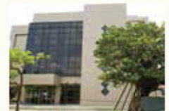
G Faculty of Engineering