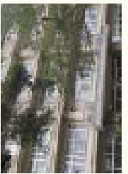
C General Education Center (Institute for Global Education)