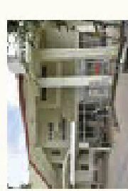
B University Hall (General Education Center & Entrance-Bldg. 201)