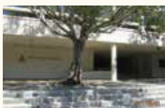
Hawaii Liaison Office