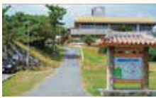
■ Miyakojima Campus