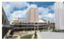
■ Naha Campus