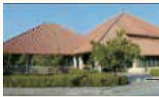
■ Ishigaki Campus

Tropical Biosphere Research Center Iriomote Research Facility