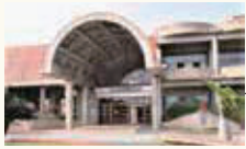
■ Kumejima Campus

Okinawa Prefecture [latitude] 26 degrees 13 minutes [longitude] 127 degrees 41 minutes