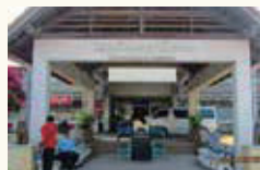
Laos Satellite Office