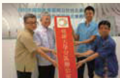
Taipei Satellite Office